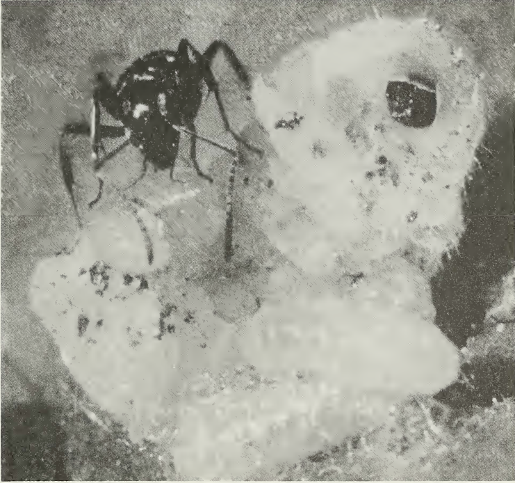
Fig. 5. Larvae of Apanteles cyaniridis , freshly emerged from mature Glaucopsyche lygdamus caterpillar. The wasp larvae are not attacked by the attendant ant ( Formica sp.).

entirely consume all internal host tissues (observations made on a number of Lycaenidae species, see above), and neither secretory nor vibratory abilities persisted. Instead, the caterpillars were abandoned by their tending ants 1-2 days prior to parasitoid emergence and vibratory behavior likewise ceased at roughly that time.